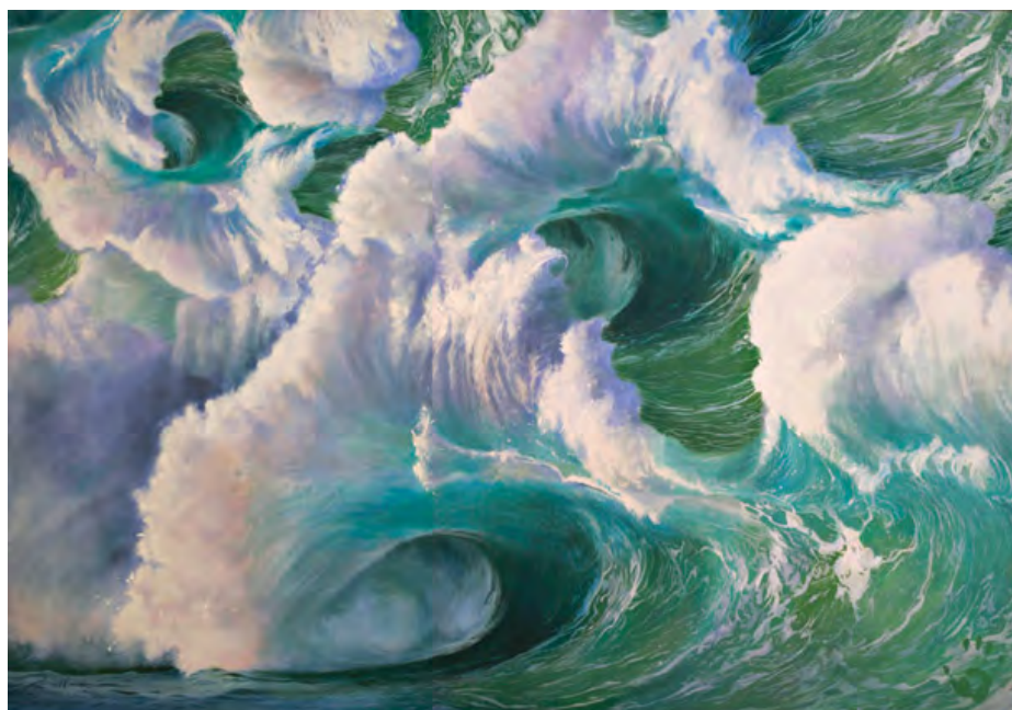
"The Wave"

the viewer can see the wave, the energy, the motion, but it is the process that makes it real. the wave is the medium, but the new technology and visual modes bring exterior symbols into the painting. they are triumphant. there is height and depth. the artist's attempt to "pull light out of the canvas" is palpable. "the fields of color leap into the air creating a sea within the sea."